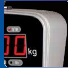
Die Cast Aluminium housing, ideal for rough industrial environments