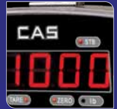
Highly legible LED large display (30mm), easy to read from a distance